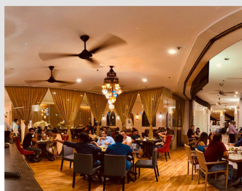
SHABESTAN, FINEST PERSIAN RESTAURANT

Created from the heart, each dish at Shabestan is made from scratch using the finest Persian spices and herbs. Our culinary team adheres to authentic Persian cooking techniques that has been satisfying middle eastern food cravings for the last 7 years.